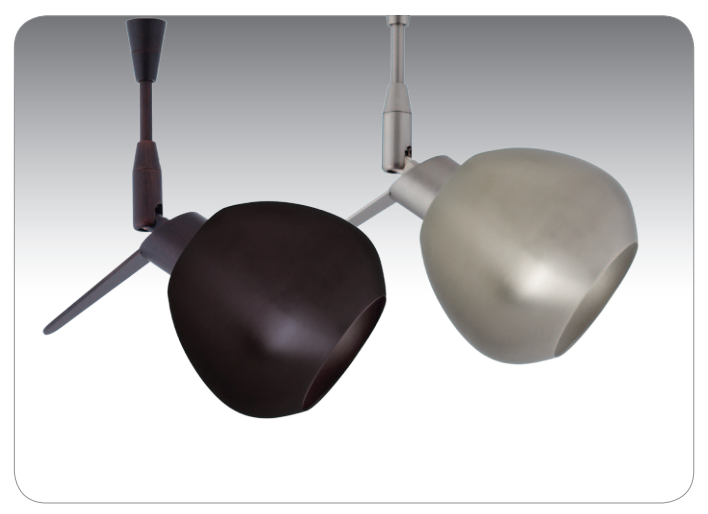
MOJO IN BRONZE & SATIN NICKEL W/ LED OPTION