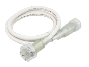
Linking Cable Jumper for LED Flexbrite Kits Interconnectable